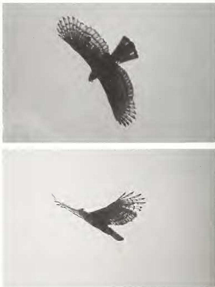
Fig. 2 a) and b) Javan Hawk Eagle, female soaring, August 1994, Mt. Slamet, central Java

Recently a hitherto undescribed plumage phase of the Oriental Honey-buzzard Pernis ptilorhyncus ptilorhyncus was found in the southern region of West Java (van Balen et al. in prep.). This form (possibly an immature) lacks the barring on its underparts and shows similarities with immature Javan Hawk Eagle, similar as described for the Sulawesi Hawk Eagle Spizaetus lanceolatus and the Barred Honey-buzzard Pernis celebensis (e.g. Meyer and Wigglesworth 1898, Watling 1983). Although Oriental Honey-buzzards are much smaller and more slender than Javan Hawk Eagles, and their mode of flight (very deep wing beats) is quite different as well, the possible similarity in their plumage has to be taken into account when identifying these species.